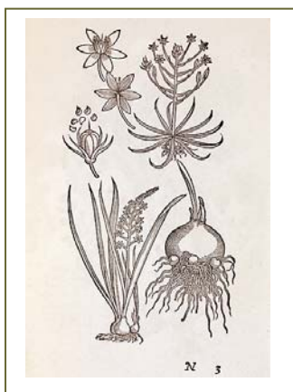
A woodcut of an 'Ornithogalum', from J. Simmler's Vita clarissimi philosophi et medici excellentissimi Conradi Gesneri, Zurich, 1566

The exhibition runs until January 2014. Master Lloyd's guide can be purchased in the Treasury office for a reasonable £5.00.