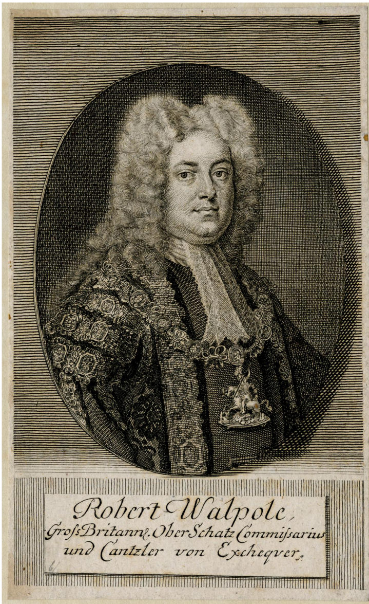
1. Sir Robert Walpole