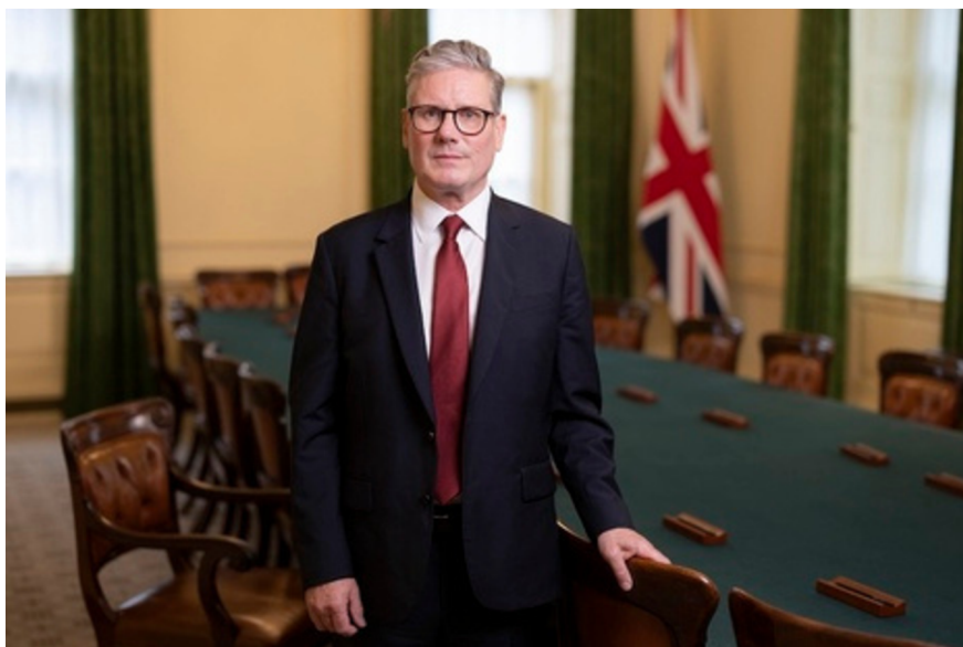
58. The Rt Hon Sir Keir Starmer KCB KC MP