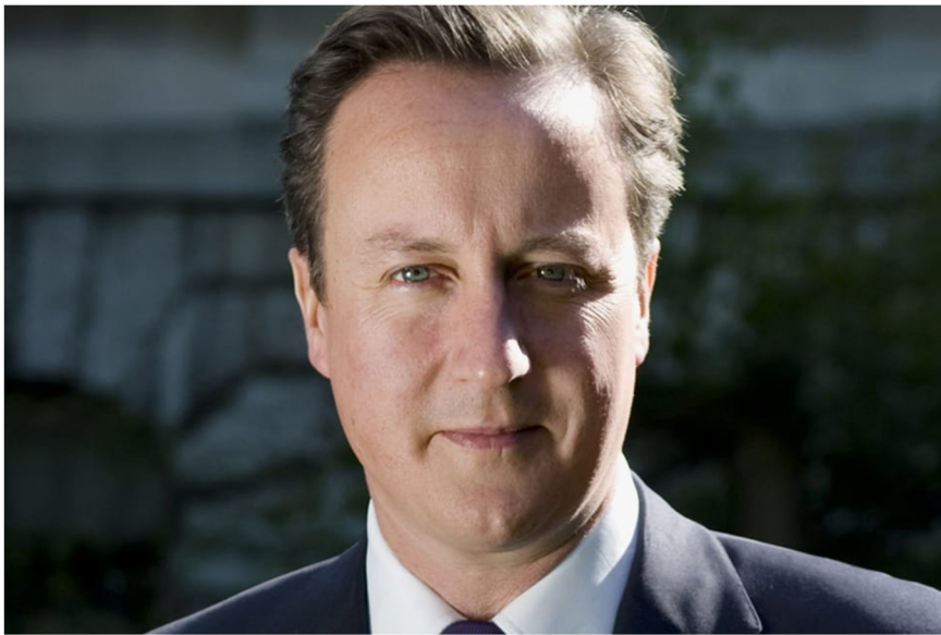
53. David Cameron

- Marriage (Same Sex Couples) Act 2013 - legalised marriage between people of the same sex.