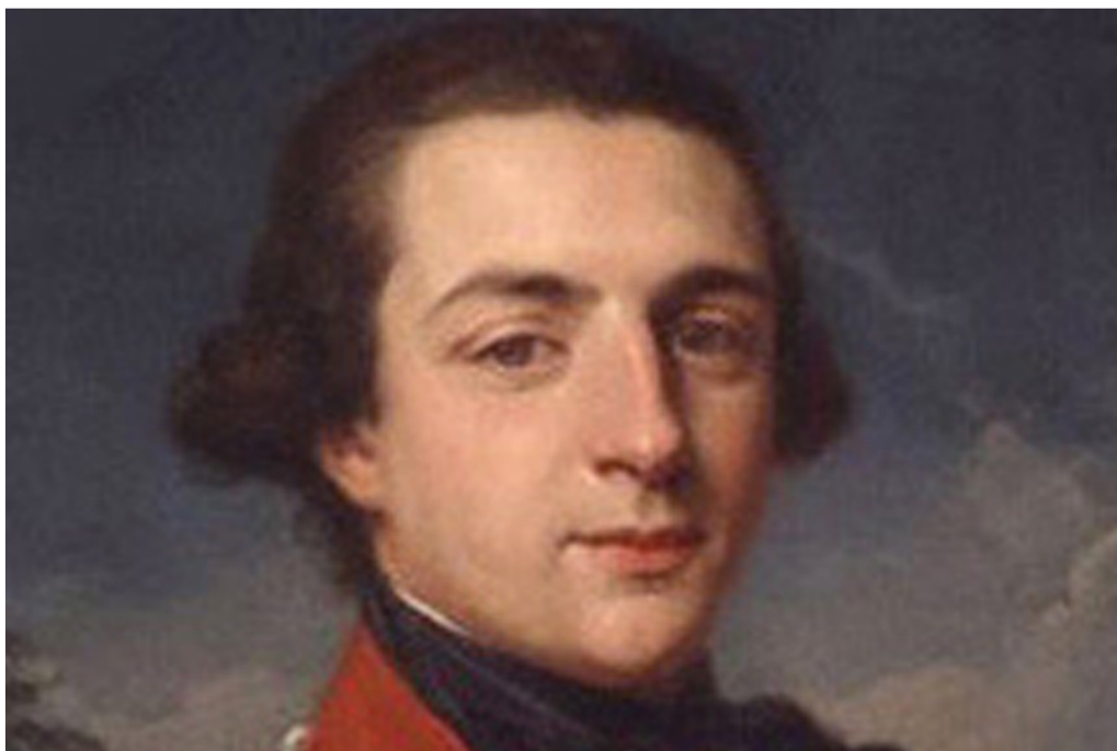
10. Augustus Henry Fitzroy

- Tea Act 1773 - sparked the Boston Tea Party and led to the American Revolution in 1776