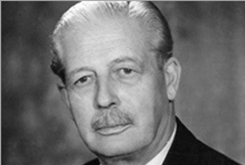
44. Harold Macmillan

- He was heavily involved in negotiating the Nuclear Test Ban Treaty, earning praise from Presidents Kennedy and Khrushchev for his patience and diplomacy.