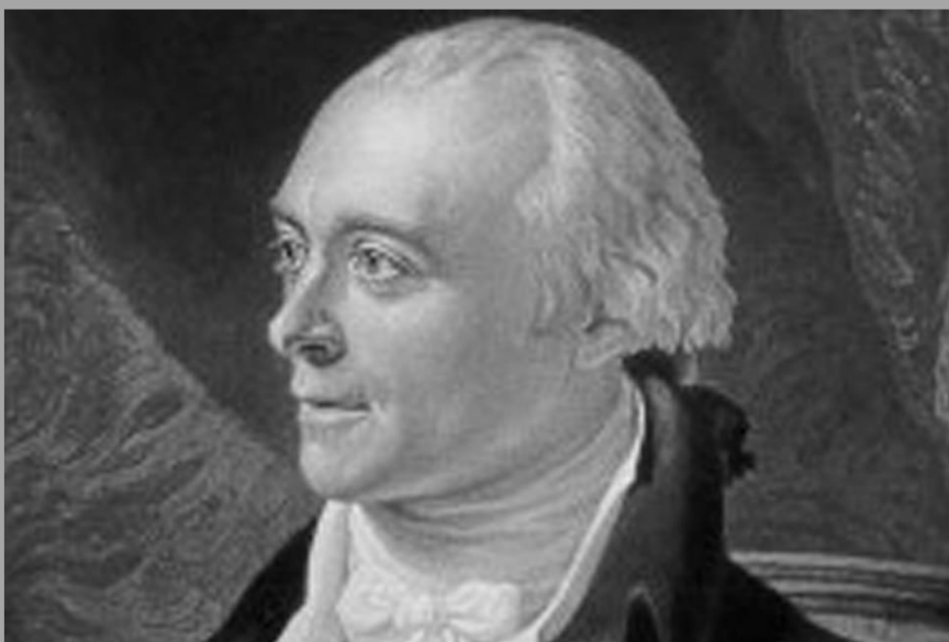
17. Spencer Percival

- Regency Bill 1810 - which, due to George III's continued ill health, appointed his son as Regent