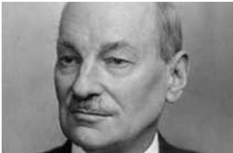
42. Clement Attlee