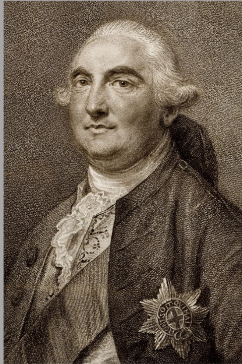
12. William Petty

Born 2 May 1737, Dublin, died 7 May 1805, London