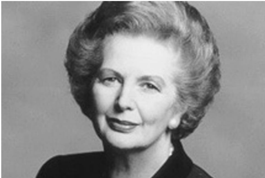
49. Margaret Thatcher

- Housing Act 1980 - gave security of tenure and the right to buy homes to tenants of local authorities and other bodies.