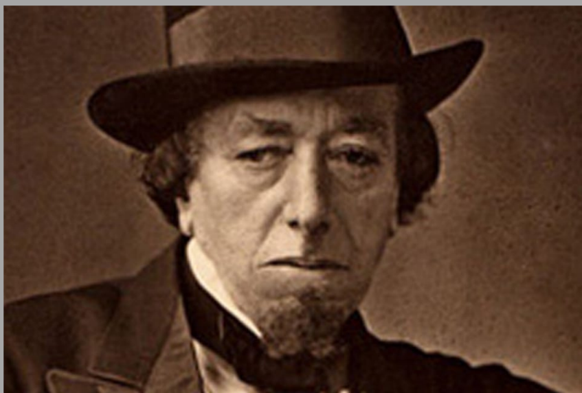
29. Benjamin Disraeli, the Earl of Beaconsfield

- Public Health Act 1875 - further improvement of sanitation and living conditions in towns.