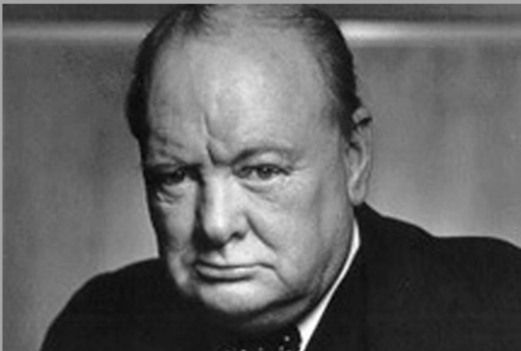
41. Sir Winston Churchill