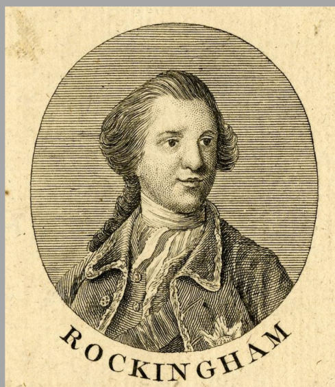
8. Charles Watson-Wentworth