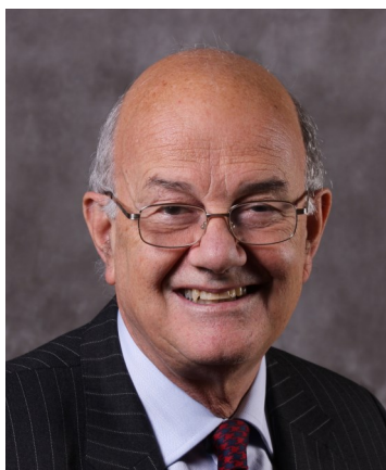
The Rt Hon The Lord Judge