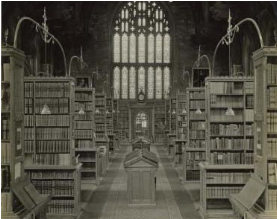
Middle Temple Library, late 19th century