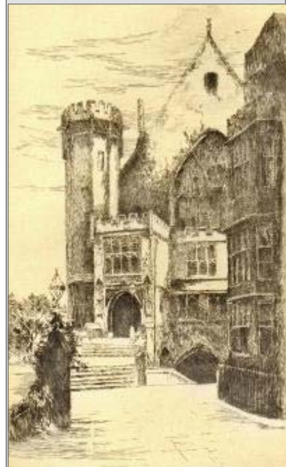
Middle Temple Library, late 19th century

A portable hearing loop, magnifier and headphones available at the Enquiry Desk