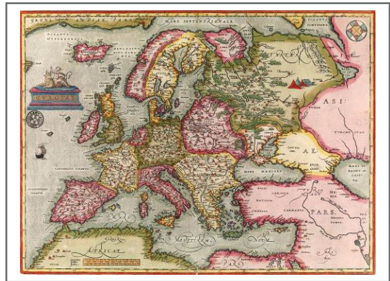
A map of Europe from Theatrum orbis terrarum, Abraham Ortelius, 1603

Library of Congress subject headings were first created in 1898 and are updated and approved on a monthly basis