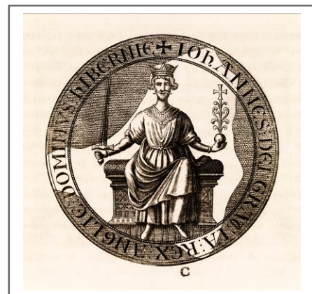
An illustration of King John, from William Blackstone's Great Charter and Charter of the Forest, 1759

Last but not least, we have now started our very popular library tours. The full schedule is available on the last page of the newsletter. Please do join us on a tour and enter our prize draw for a bottle of champagne or gift certificate.