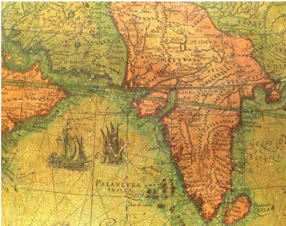
A close-up view of the terrestrial globe, depicting ships and India