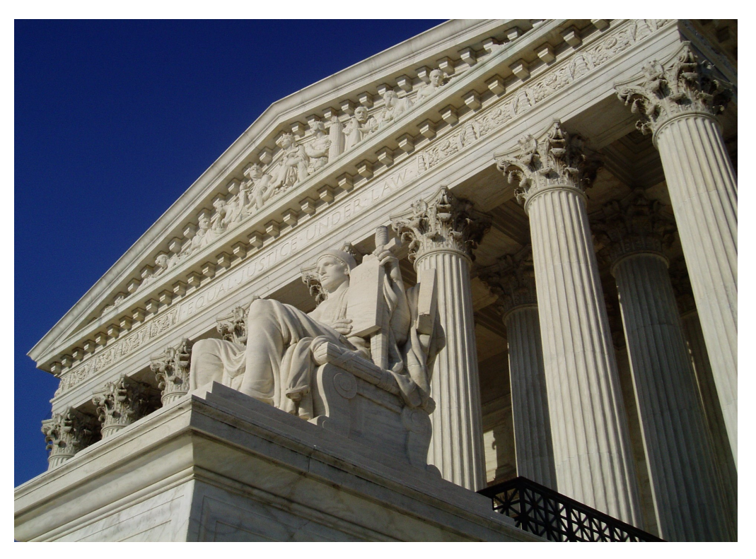
"Authority of Law"

Google Scholar : now gives full text legal opinions from US federal and state district, appellate and supreme courts, as well as links to other opinions and articles citing them. Use "Advanced Scholar Search": <a href="mailto:scholar.google.co.uk">scholar.google.co.uk</a>