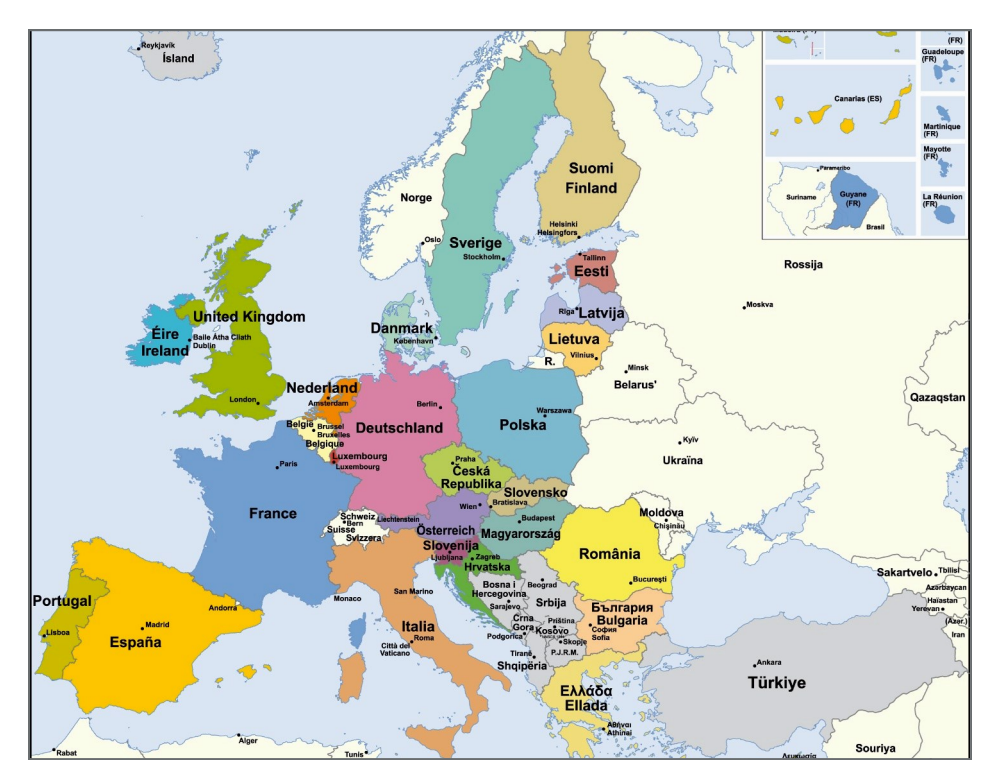
Map of Europe