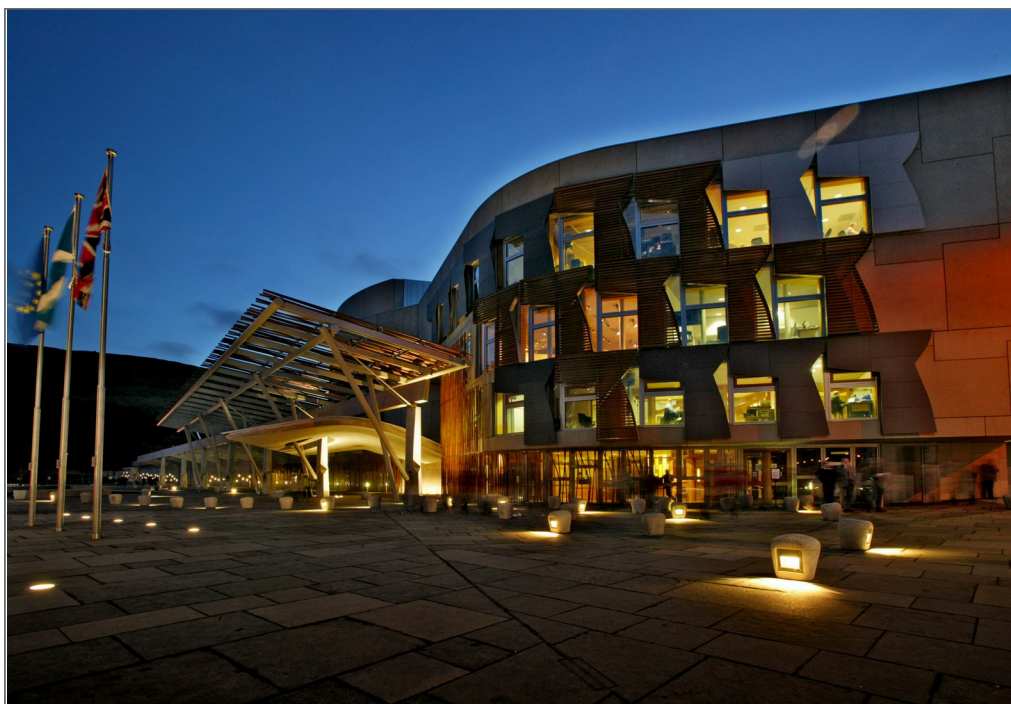
Public Entrance to the Scottish Parliament. Image © Scottish Parliamentary Corporate Body – 2012. Licensed under the Open Scottish Parliament Licence v1.0.

Scottish Parliament - Publications from Parliamentary committees, bills and official reports. www.scottish.parliament.uk