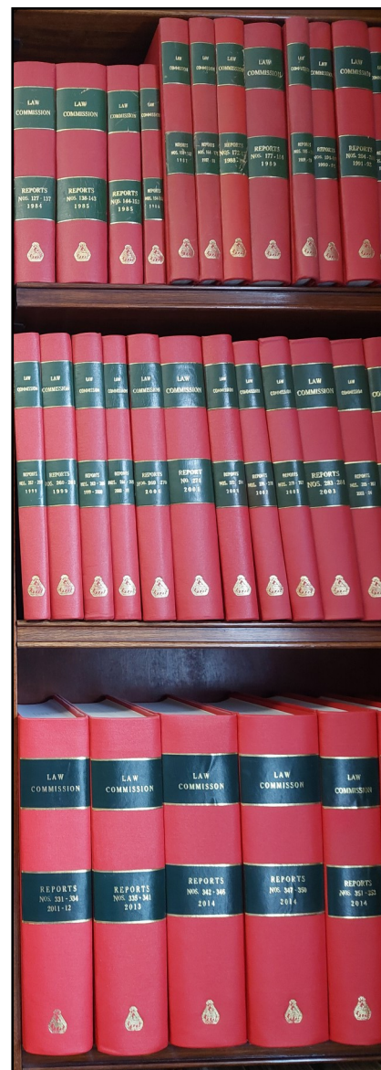
Law Commission Reports.

Public Information Online allows users to conduct Pepper v Hart research by building a collection of materials around a specific Bill. The database includes Lords papers, Bills, Standing Committee/Public Bill Committee reports and Hansard dating back to 1919.