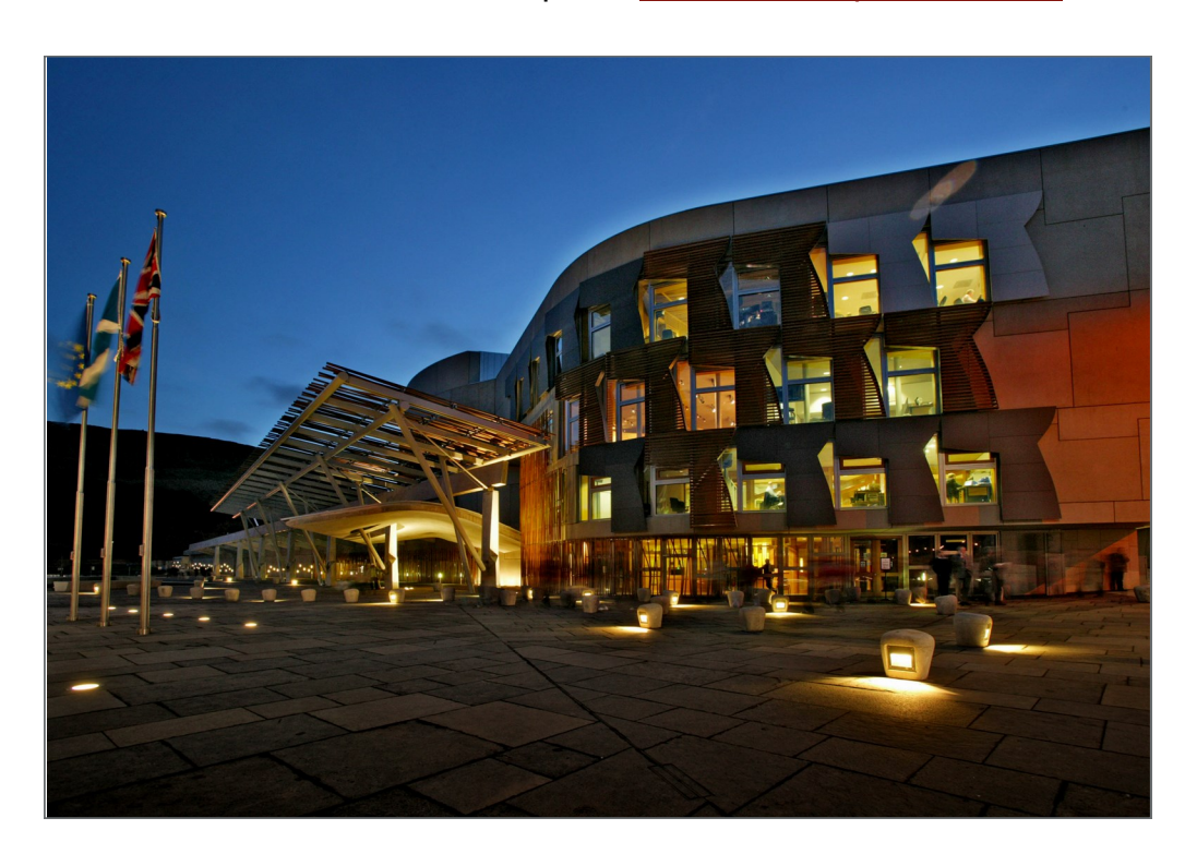
Public Entrance to the Scottish Parliament. Image © Scottish Parliamentary Corporate Body – 2012. Licensed under the Open Scottish Parliament Licence v1.0.

Scottish Parliament - Publications from Parliamentary committees, bills and official reports. <a href="www.scottish.parliament.uk">www.scottish.parliament.uk</a>