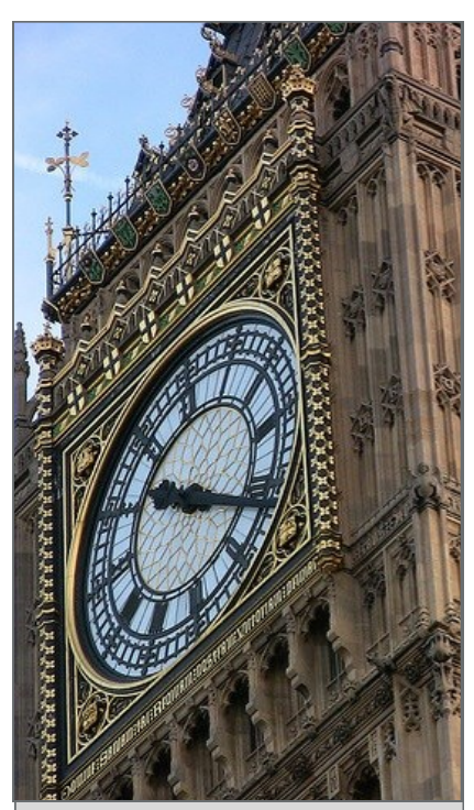
Parliamentary copyright images are reproduced with the permission of Parliament.