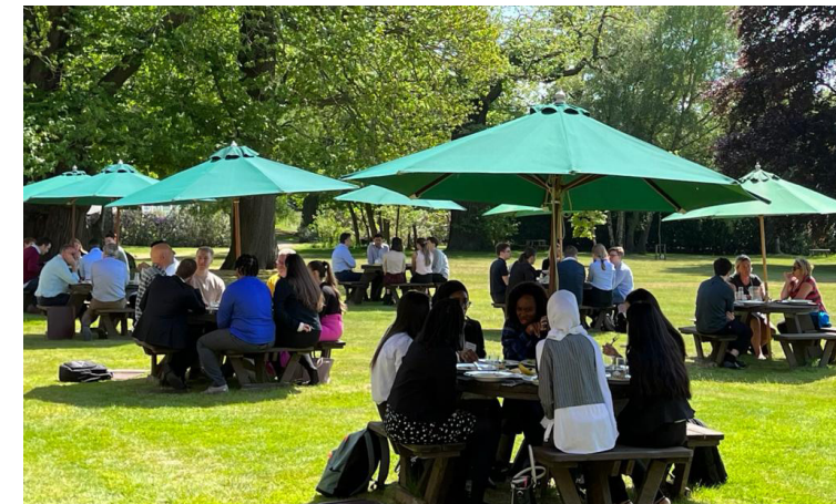
Advocacy training at Cumberland Lodge

The Treasury Office Ashley Building Middle Temple Lane London EC4Y 9BT