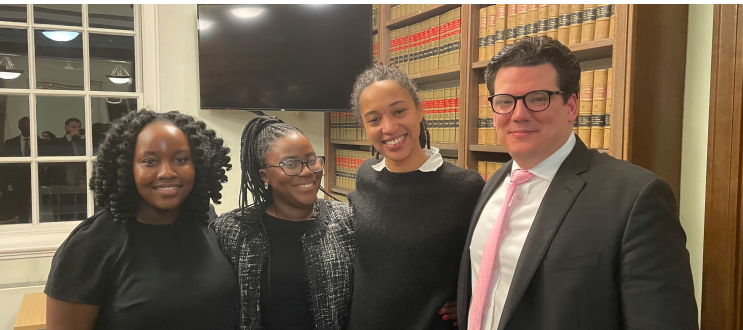
Members taking part in a panel session on pupillage

Practitioners of at least 5 years' Call can act as Moot Judges in the annual Rosamund Smith Mooting Competition. The first couple of rounds are held remotely on weekday evenings and the third and fourth rounds are held in the Rutledge Suite, Ashley Building.