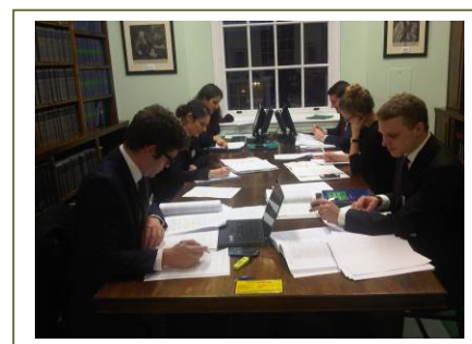
Pupils hard at work in the library on Monday 13 January 2014

Uptake has not been as high as we expected, so it remains to be seen if ebooks are the way forward for legal research purposes. Let us know what you think.