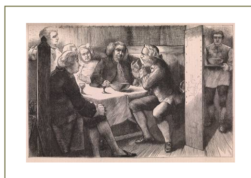
Dr. Johnson and friends From The trial at Bar of Sir Roger C.D. Tichborne, 1875

The London Collection contains over 200 items covering the history of London. It includes Stow's Survey of London, Round and about London by Tram , and a work about Brunel's Thames tunnel. Many of the items were presented to the Library in the 1940's by Guildhall Library. Presumably these were duplicate copies, and possibly Guildhall donated to the Inn to help re-stock the library after the war.