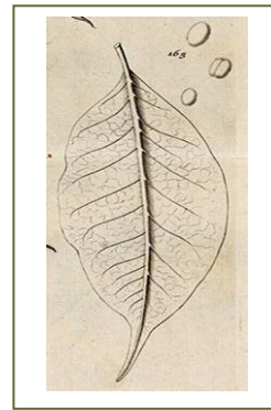
A coffee bean leaf, and some coffee beans, from 'The Philosophical Transactions, published by the Royal Society in 1749.

Coffee was introduced in England by the East India Company and the Dutch East India Coffee. The first coffeehouse in London was opened in 1652; the first in England was in Oxford in 1650. The East India Company is also responsible for introducing tea to England in 1664, to satisfy Catherine of Braganza's