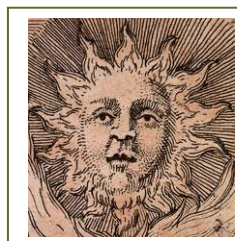
The sun, as envisioned by Michael Maier, an alchemist. From his 'Symbola aureae mensae duodecimo nationum' (Frankfurt, 1617)

We have sofas where you can curl up and read a good law book (or enjoy a cup of coffee).