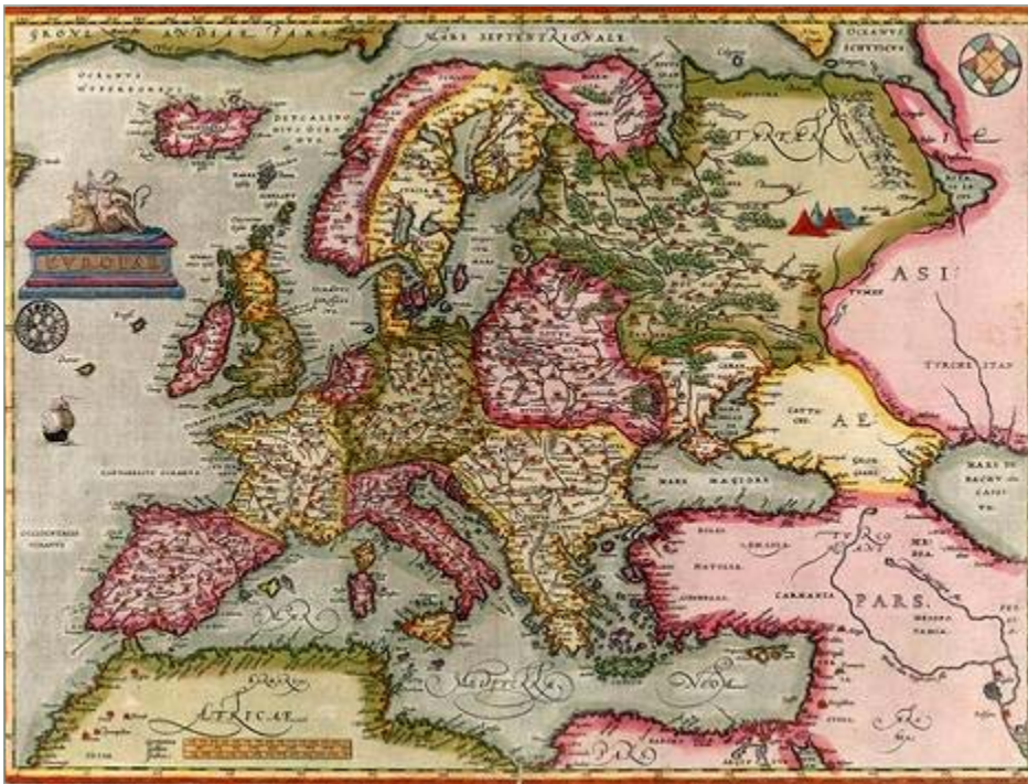
Abraham Ortelius' map of Europe, 1603