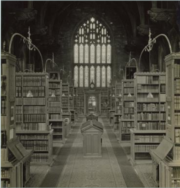
Middle Temple Library, late 19th century