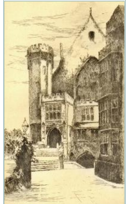
Middle Temple Library, late 19th century

A portable hearing loop, magnifier, typoscope & two sets of headphones available