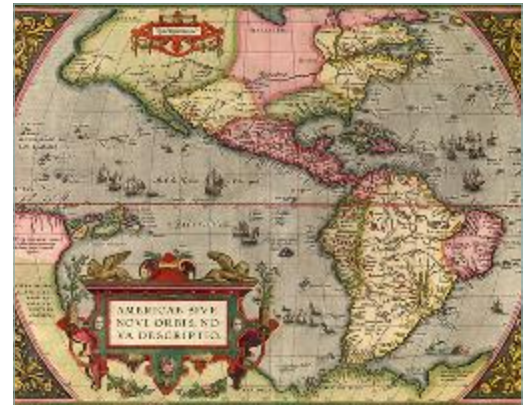
Abraham Ortelius' map of the Americas, 1603

consists of books and other media covering current aspects and the history of the death penalty around the world. It is available for loan.