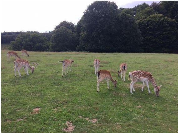
Deer at Knole Park

http://www.pfc.org.uk/caselaw/Rees%20vs%20The%20United%20Kingdom.pdf