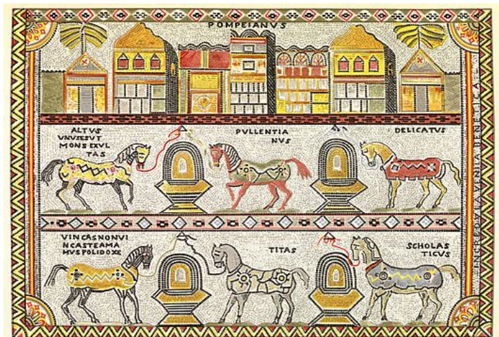
19th-century colour lithograph of a mosaic depicting a Roman noble's stables from Pompeii.