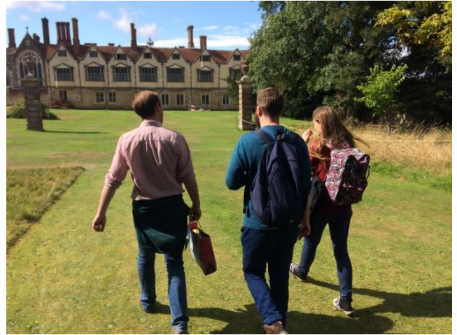
Knole House and Park

The National Trust now owns and takes care of most of the house, although the vast majority of the park still belongs to the Sackville family, who have resided at Knole since 1566. Sackville descendants include Vita Sackville-West, probably now most famous for her garden at Sissinghurst and for being a lover of Virginia Woolf. This is one of the reasons why Knole House forms part of a programme put together by the National Trust which explores the LGBTQ history of places under their care and management. The history of the Sackville family is said to have inspired Woolf's gender-bending novel Orlando , and Vita herself was the inspiration behind the eponymous protagonist.