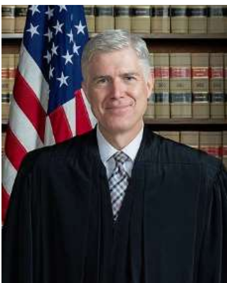
Justice Neil Gorsuch

Court of Appeals for the District of Columbia Circuit from 2003–2005. Nominated as Chief Justice of the United States by President George W. Bush, he assumed that office on September 29, 2005.