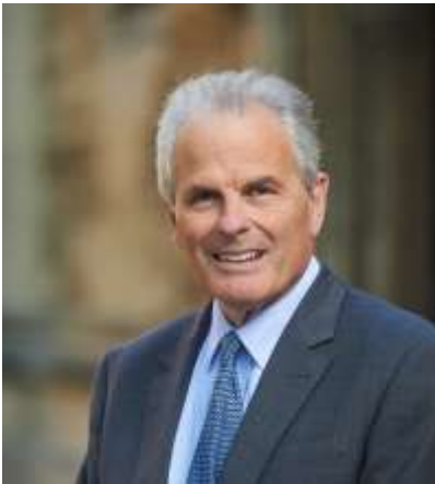
The Rt Hon Lord Dyson (Master Treasurer)