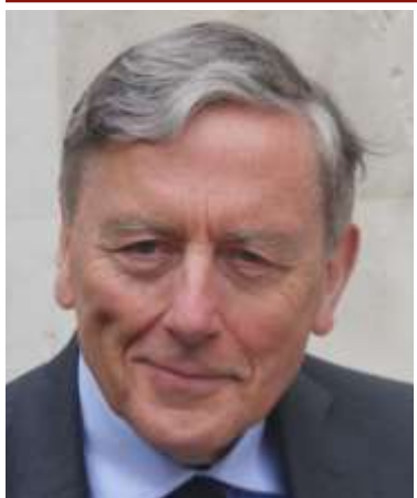
The Rt Hon Sir Christopher Clarke (Master of the Bench)