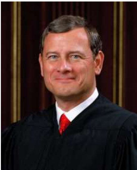
The Hon. John G. Roberts, Jr